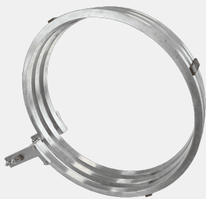
Fixed / closed coil 500