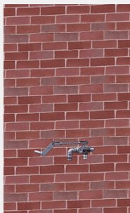
MB 20 TTW