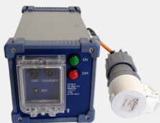
AC Battery Pack 42 V klein