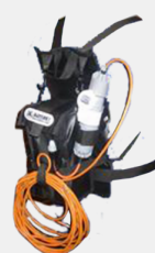
AC Battery Pack 42 V klein